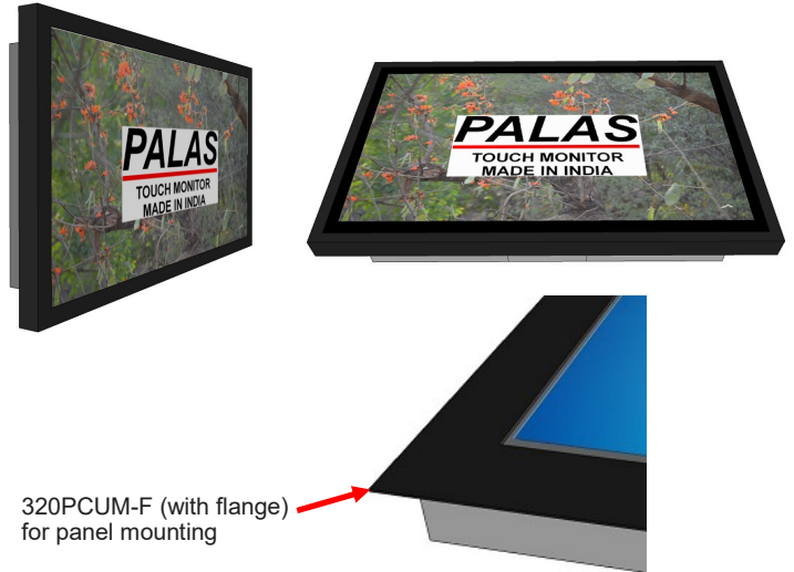
320PCUM-F (with flange) for panel mounting

Unique metal frame PCs for use in harsh environments. Rugged design. Easy mounting through VESA mounts. Anti-reflective.